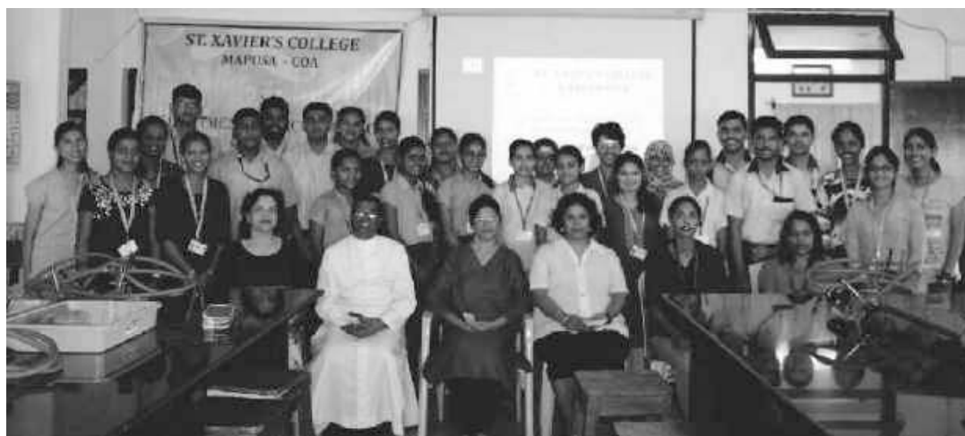
Participants at the Microbiology lab

Dona Paula and St. Xavier's Higher Secondary School, Mapusa, participated in the programme which provided hands on experience in basic techniques in microbiology and molecular biology.