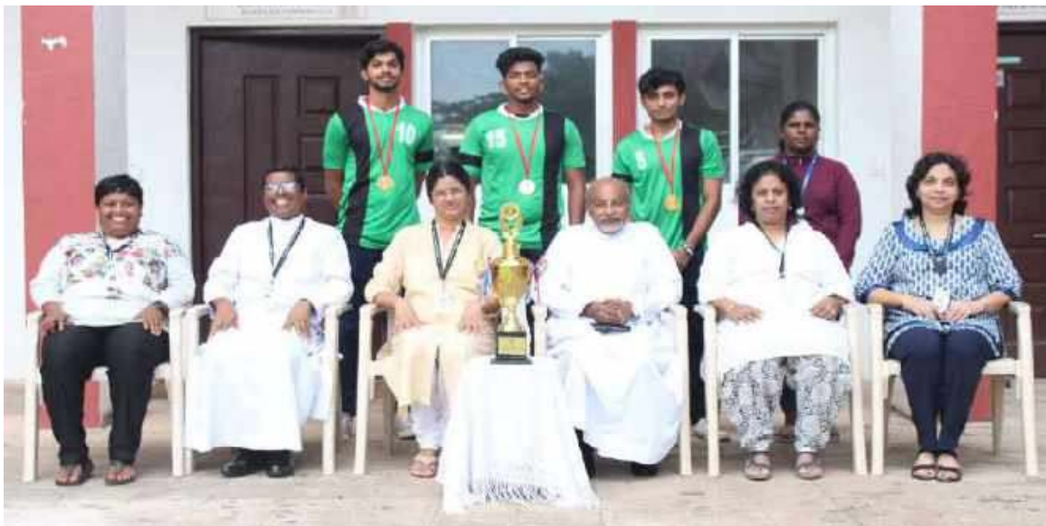
Winners Swimming (Men)