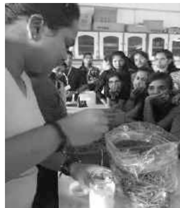
filling of bags with paddy straw

spawn using Jowar grains. They were first briefed on the technique of cultivation of Oyster mushroom ( Pleurotus sajorcaju ). The paddy straw was cut into pieces and soaked in hot water by the lab attendants. The students then filled the bags with the straw and the spawn. The bags were tied and kept for spawn running in the laboratory. After a week the students observed the bag and saw the growth of the mycelium. The bags were then opened and removed. It was watered everyday and kept for the growth of mushrooms. After a week small pinhead sized fruiting bodies were seen in various stages which then grew into large oyster shaped mushrooms.