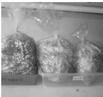
Bags kept for incubation