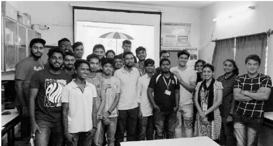
Participants of User Experience design work

An in-depth explanation was given on how UX design is used to create products that provide meaningful and relevant experience to users, this triggered the minds of the students into thinking innovative ways to design a product and explore the world of Design. The talk was attended by the second year and third year students of Computer Science. The talk ended with a vote of thanks proposed by the head of the Computer Science Department.