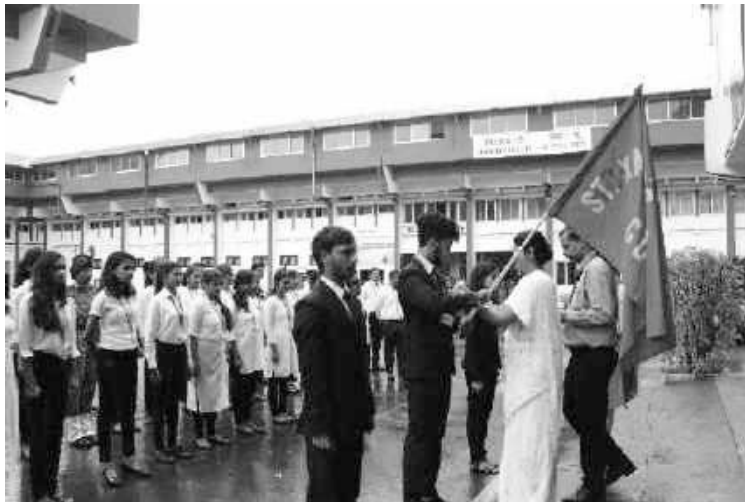
Induction Ceremony of Students' Council 2019-20