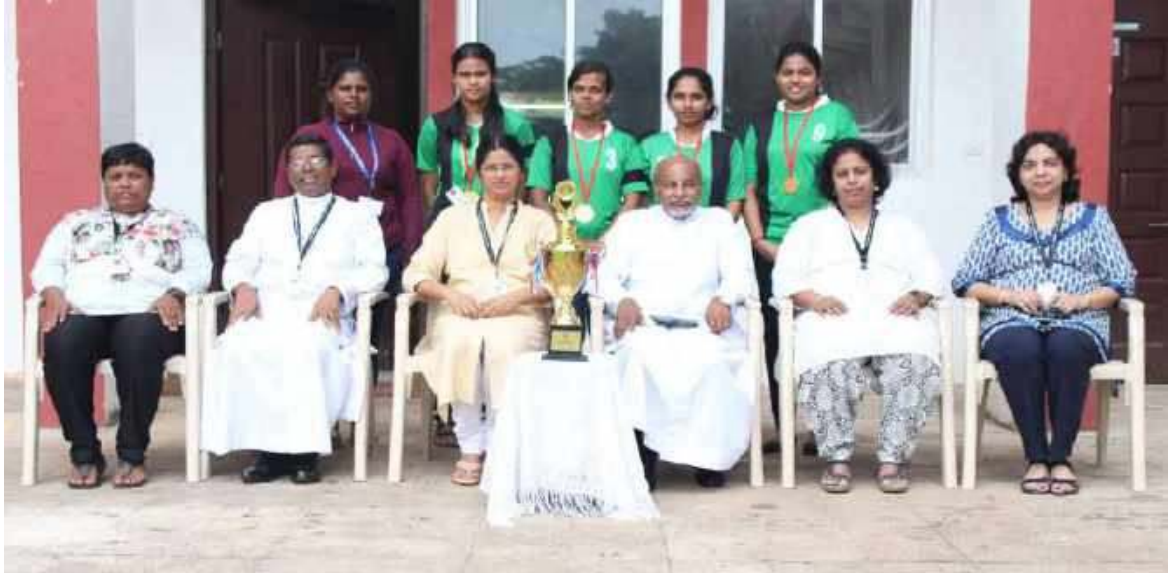
Winners Table Tennis (Women)