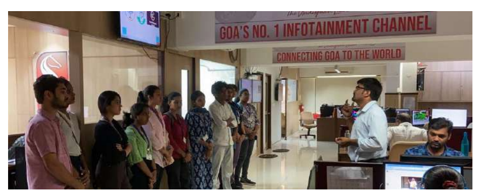
Xavier's Post News Desk