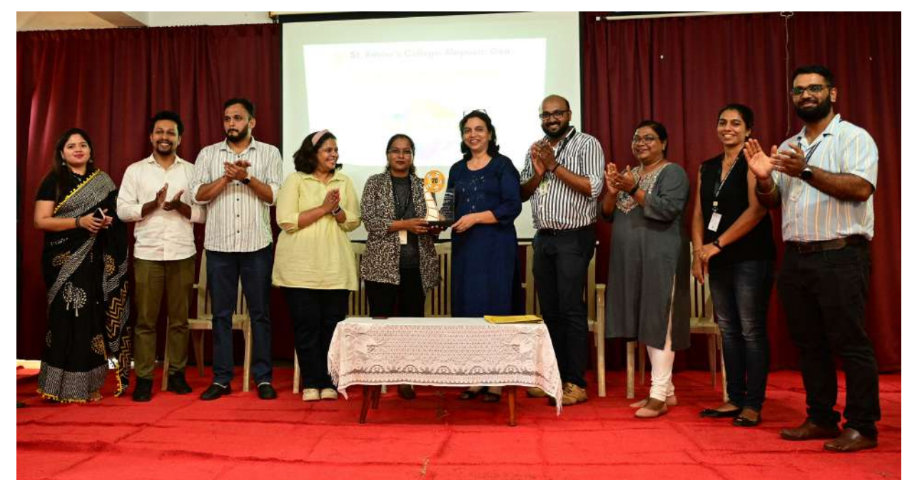
MILESTONE: Department of Mass Communication faculty celebrate 20 years with a cake cutting ceremony.