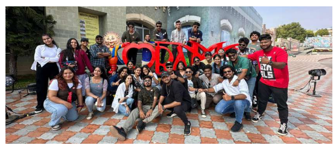
MEDIA TOUR: Department of Mass Communication and Journalism students pose for a picture during their media tour in Hyderabad